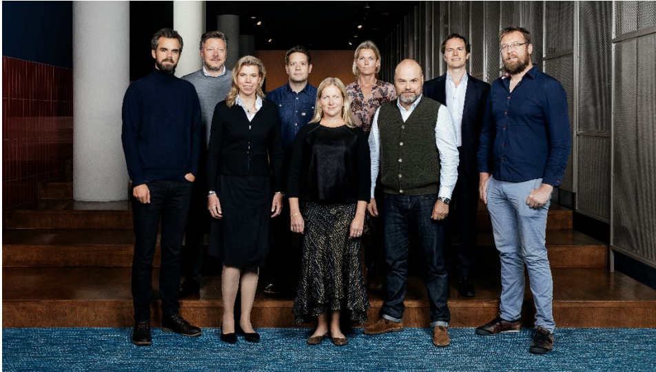
The Supervisory Board – from left to right: